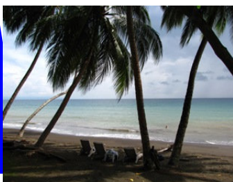
Malolo beach in Madang