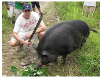
Walking through the community @ Kudjip