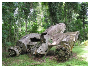
WW2 Japanese Bomber wreck in the jungle close to Madang