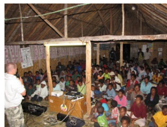
MAF ministry team @ Kudjip Hydro Nazarene