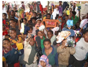
Children @ the Christmas celebration

meaning of Christmas. Followed by this was the handing out of presents for each of the children and other gifts that had been donated to the ministry. The smiles on the faces of the children were priceless. The presents were disturbed and at times was difficult to keep the crowd of kids under control. Following the presents being given out, including new shoes for some of the older boys, there was a time of speeches. It was encouraging to see how in six months of the ministry starting, how far God had brought it and faithfully provided, despite the great need there is. It was a hard hitting and heart breaking experience seeing these kids after hearing so much. I look forward to seeing what God has installed for BFO this year.