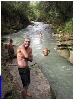
Swimming @ Suicide Gap

"I am really grateful for the opportunity I have had to serve in PNG as my first term comes to a close. For God sustaining me during this time, for the experiences I have had & relationships formed"