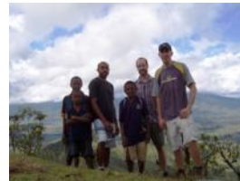
Summit of Mt Hangkuki

service. He was a mentor to me unofficially. The other ministry that I have been involved in is Bible Faith Orphanage. There are a few projects I have been working on. The main one taking portrait photos of all the children and have them uploaded onto a website so people can sponsor the children.