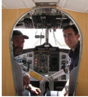
Ben & I in a Twin Otter cockpit after an engine run and adjustment