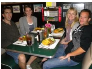
Mel’s Diner in Hollywood