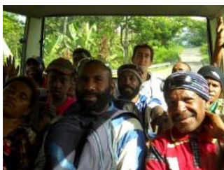
PMV ride to Goroka