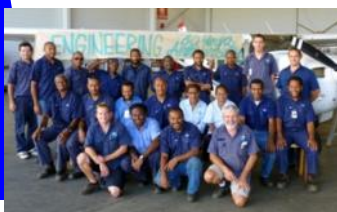
Mt Hagen Engineering Team 2011