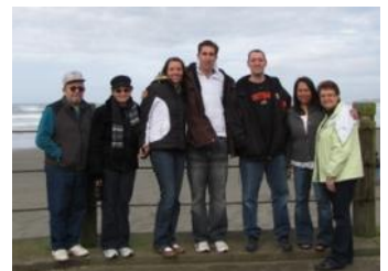
Newport, Oregon Coast