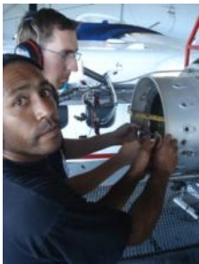
Maipson & I working on a PT6 hot section

“ The last four months have really been full on with many different experiences. I am really grateful for God’s goodness and faithfulness...”