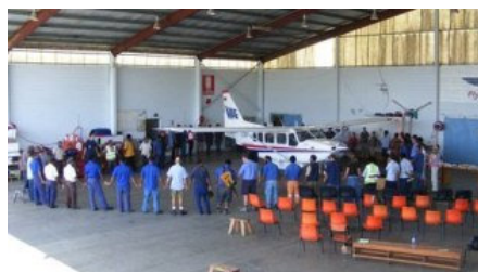
GA8 Turbo Dedication Service

sunrise was amazing. But followed by that was the whole 360 degree view around us. The most glori-