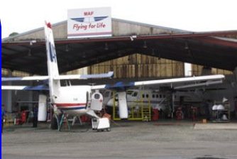
The Hangar packed