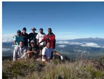
The crew at Mt Hagen summit

ous sight I have seen with my physical eyes. After spending some time up on the summit and taking in the view. We made a start on our descent. I was tired and sore from the previous day, plus battling with some food poisoning and was thinking how I would go going back down. I was happy to stay up there for a week. We made it down in about four hours. Again I found it hard and my knees started to find it difficult along with other parts of my body. In the end it was an awesome hike, but the hardest hike I have ever done and good time of bonding with the guys. We had great weather for the two days too. Something we were really thankful for. Returning to work Monday I was so sore and tired, but yet so refreshed from the experience.