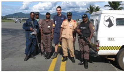
My Posse @ Kagamuga Airport