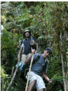
Coming down the track

“In the end it was an awesome hike, but the hardest hike I have ever done and good time of bonding with the guys”