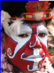
50th Mt Hagen Cultural Show

“Our first time serving together and something that I greatly look forward to in the near future. Sharing life and serving together.”