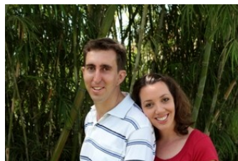
Engagement photo shoot