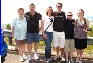
with family in Cairns