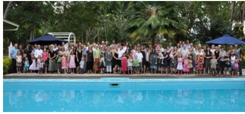
MAF Expat family at Conference 2011