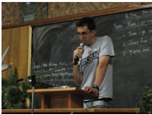
Sharing my testimony in Tok Pisin at the youth outreach