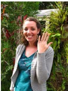
The bride to be with ring