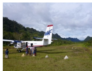
A medivac at Woposali