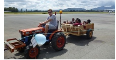
Tractor rides at MAF's 60th family fun day