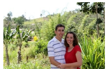
Being culturally inappropriate